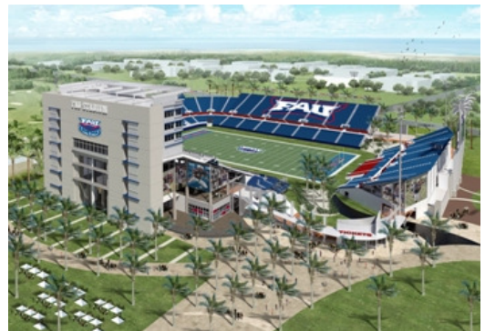
Artist's rendition of FAU's new on-campus football stadium